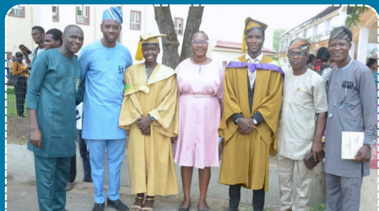
Award Presentation to the Best Graduating Students

The committee is of the opinion that the association should raise as much funds as possible to cover all the requests although a particular item/request has been prioritized.